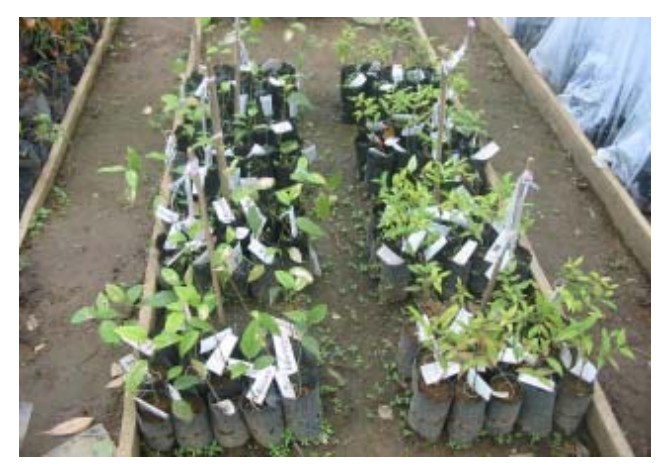
Agathis philippinensis and Cinnamomum mercadoi planted in various potting media.

The wildlings collected were grown in various potting media such as, a) Mansawan soil; b) forest soil from Palo 6; c) mixture of forest soil and horse manure; and d) mixture of forest soil and moss. The wildlings were also subjected to naphthalene acetic acid, a hormone that significantly increases the number, length, and dry weight of root hairs, small roots and large roots; benzyladenine, a plant